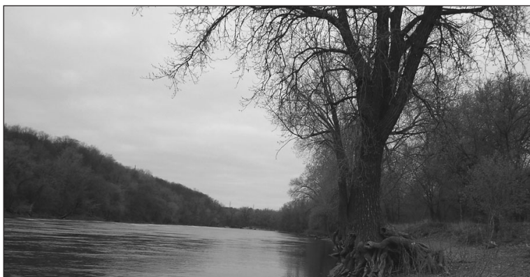
Mississippi River bank and tree