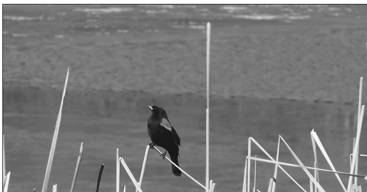
Red-winged blackbird on the Mississippi River bank in Saint Paul