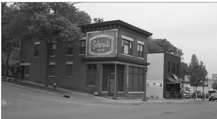
Schmidt beer sign on the West Side