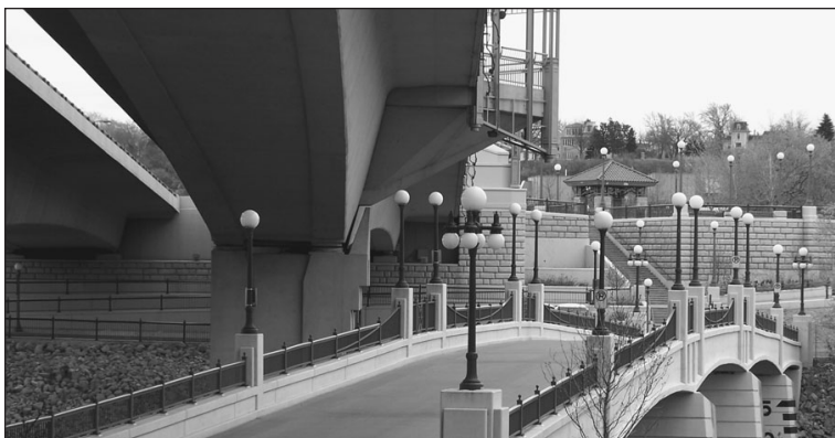
Bridge joining Harriet and Raspberry islands