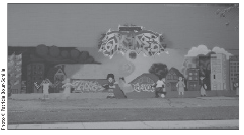
Peace in Harmony mural, 66 East Rose Avenue

M urals are famously ephemeral. Sun fades their colors; ice and rain work their damage; surfaces crack, chip, and peel; buildings themselves rise and fall. Being public art, they sometimes generate controversy too: people object on aesthetic, political, social, or other grounds.