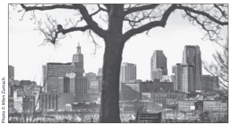
Saint Paul skyline from Indian Mounds Park with a tree silhouette in the foreground